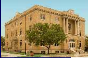
The location of our monthly meetings is changing

The location of the May monthly membership meeting is moving to larger facilities to accommodate our increased membership and attendance.